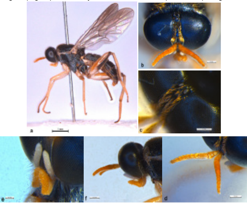
Figure 3. Morphology of Solva andamanensis sp. n. a) habitus, b) head (front view), c) ocelli, d) antenna, e) palpi and labia, f) head (side view).

almost entire length and width of the head leaving no such conspicuous genal and post genal region (Fig. 3f) however, yellow and silver hairs present in post genal region.