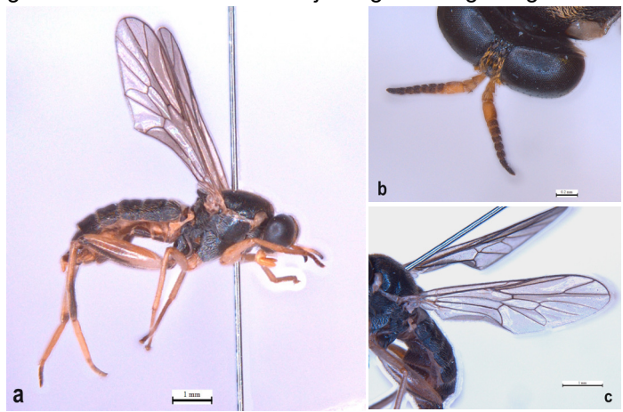
Figure 6. Morphology of Solva javana (Meijere, 1907). a) habitus, b) antenna, c) wing.

Wing of Solva javana is comparatively less infuscated (Fig. 6c), whereas, in the case of Solva andamanensis , it has a distinguishing dark-brownish infuscation at the tip of the wing where the Radial veins are joining the wing margin.