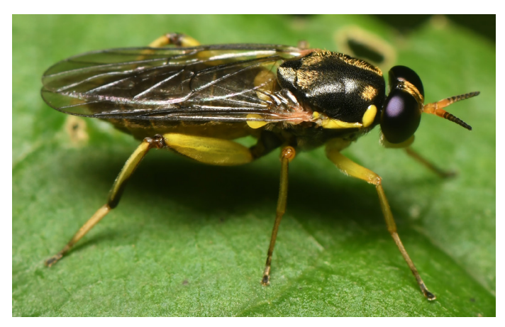
Figure 2. Field photograph of Solva javana (Meijere, 1907).